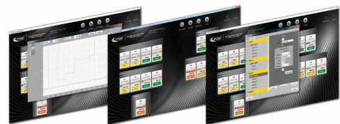
DEGA VISIO III visualization software