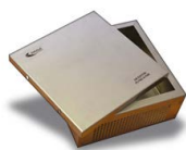
Cover for transmitter NB III Stainless steel 316