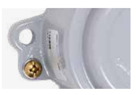
Thanks to the external installation slots.